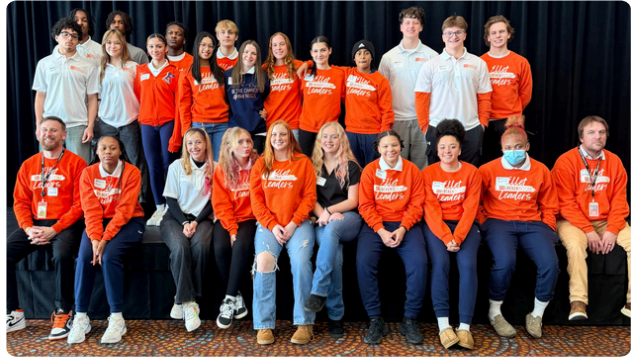
ELLET'S LRE MEMBERS